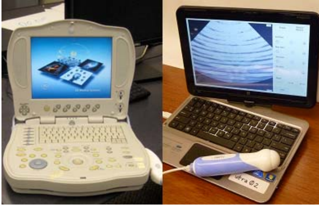
Figure 1. GE LOGIQ Book (left) and our system (right)

in order to detect basic pregnancy complications (See Figure 1). The GE LOGIQ Book is designed for expert ultrasound users and it maximizes the functionality of the machine; while an excellent device for clinical settings with highly trained practitioners, it is less appropriate for midwives with abbreviated ultrasound training.